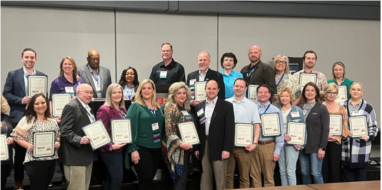
SEDCO received the Texas Economic Development Council's 2022 Economic Excellence Recognition Award.