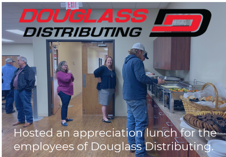
Hosted an appreciation lunch for the employees of Douglass Distributing.